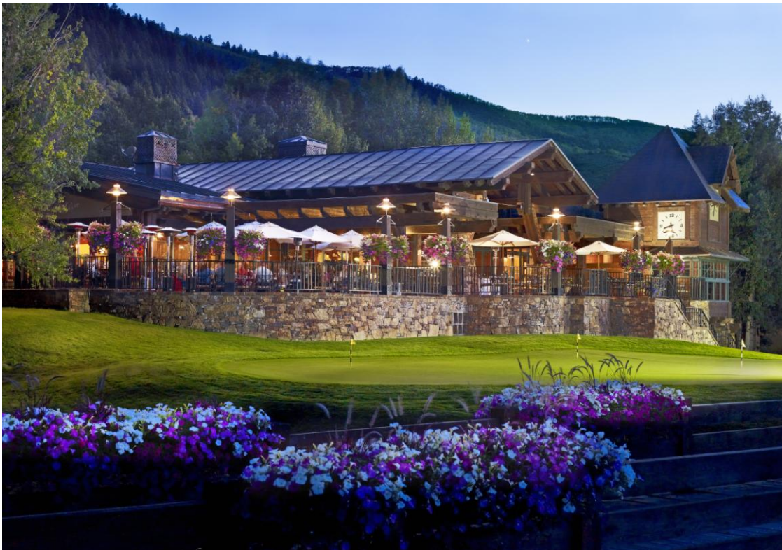
A View of the Vista Patio from the 18 th Hole

Vista at Arrowhead can accommodate up to 150 people inside plus seating for 80 people on the terrace overlooking the greens. The Ford room accommodates up to 24 people, the club room up to 80 people. When the rooms are connected, we can accommodate 100 without having to reserve the full facility. Any parties over 100 up to 150 in the winter and 250 in the summer would need to reserve the entire restaurant.